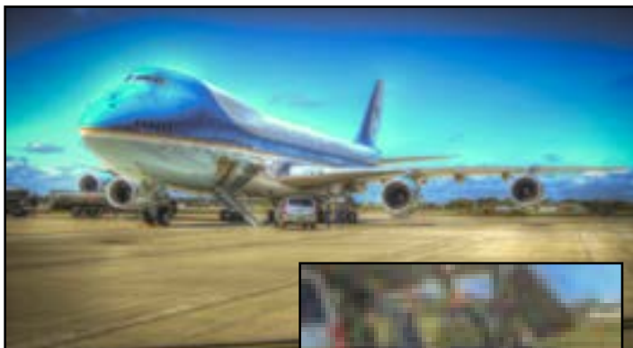
HDR or filtered images (detail shows "ghosting")